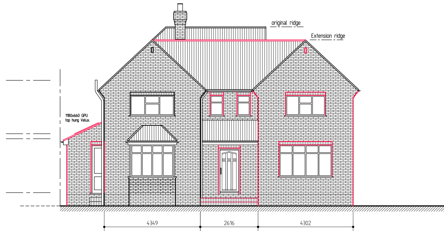
Front Elevation (North West)