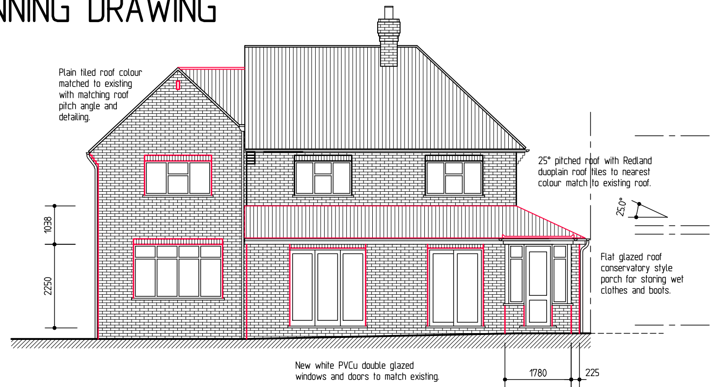
Rear Elevation (South East)